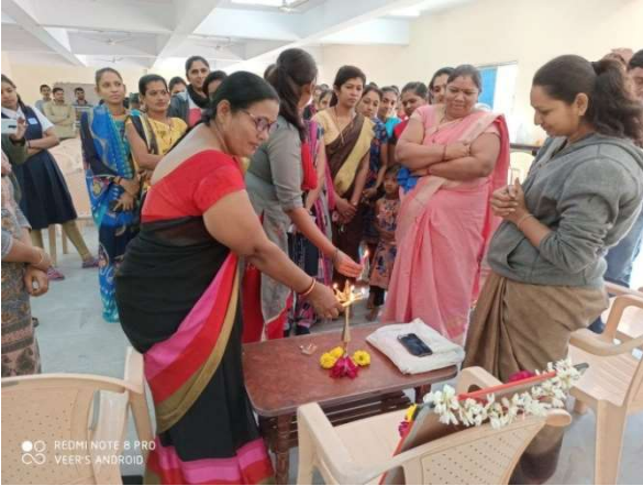
Inaugural Light lamping by Sakhimandal